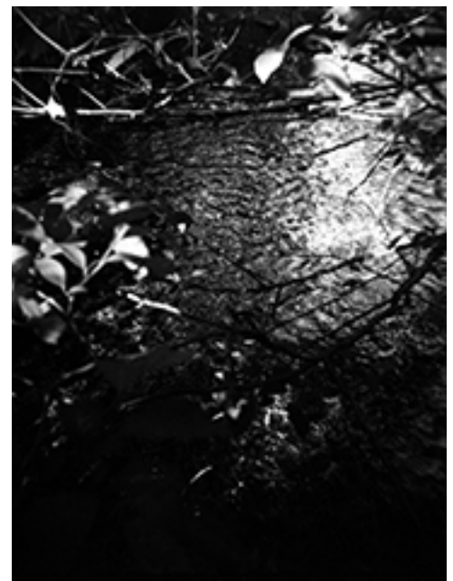
Water Wrackets, Benjamin Funke Second Place Humboldt Photography Exhibition