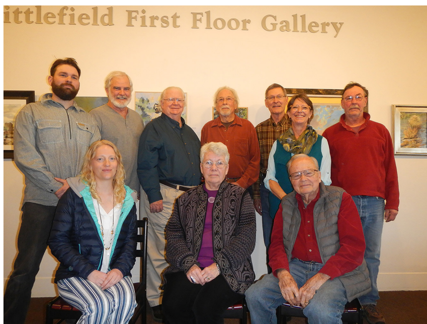
Partial Board of Directors