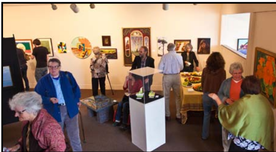
Arts Alive! at 603 F St.

Each artist received a $250 honorarium during the Set, 6 meeting of the Eureka City Council. The honoraria were made possible through generous donations made by Eureka Natural Foods and Coast Central Credit Union.