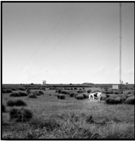
Best of Show winner "Transmission" in photo exhibit.