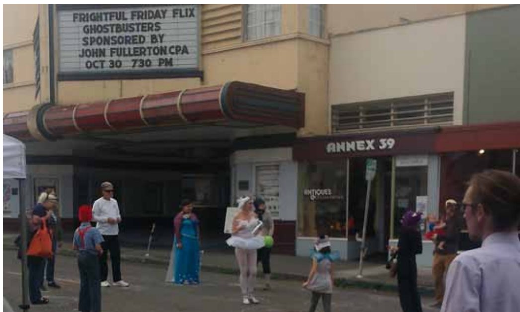
Halloween Cake Walk.