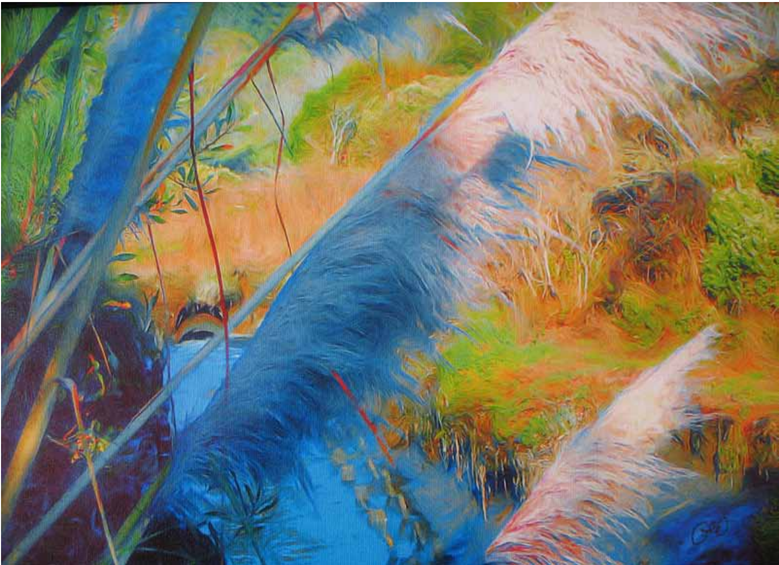
Below: "Symbiotic Shadow & Light" by George Ventura.